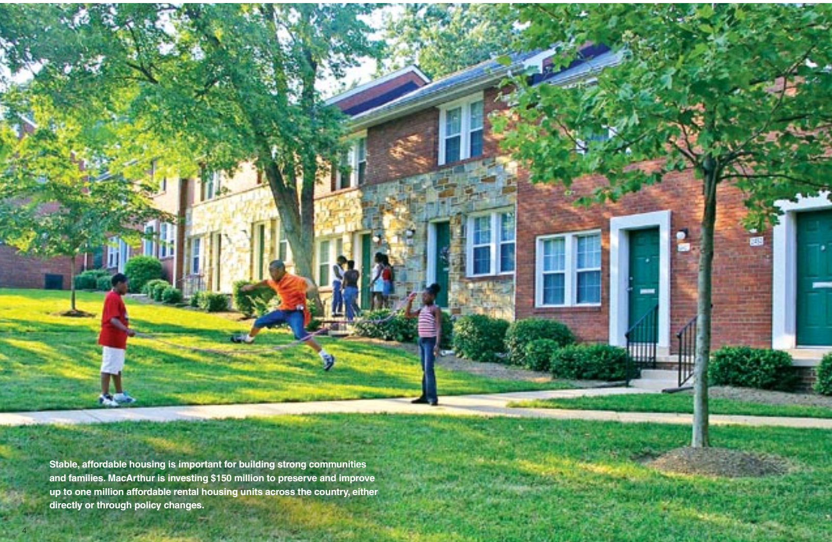
Stable, affordable housing is important for building strong communities and families. MacArthur is investing $150 million to preserve and improve up to one million affordable rental housing units across the country, either directly or through policy changes.

My first priority is to be sure we are making the right choices to have a significant impact.